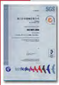
ISO 9001:2000 Certification